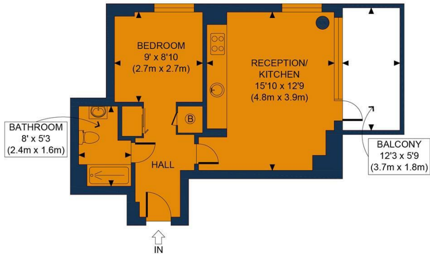
SIXTH FLOOR GROSS INTERNAL FLOOR AREA 558 SQ FT